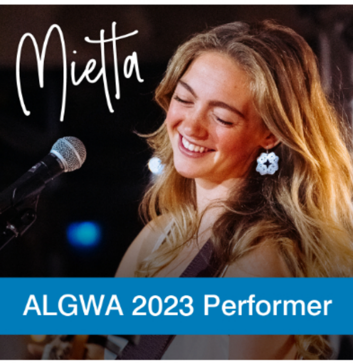
ALGWA 2023 Performer

We're thrilled to present local musicians.