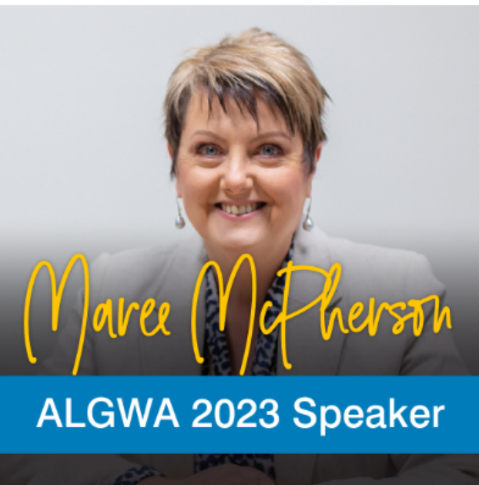
ALGWA 2023 Speaker

"For women, particularly women who work in rural and regional communities like me, an excess of advice, self-doubt and comparison often stand between them and their potential."